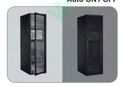
Auto ON / OFF